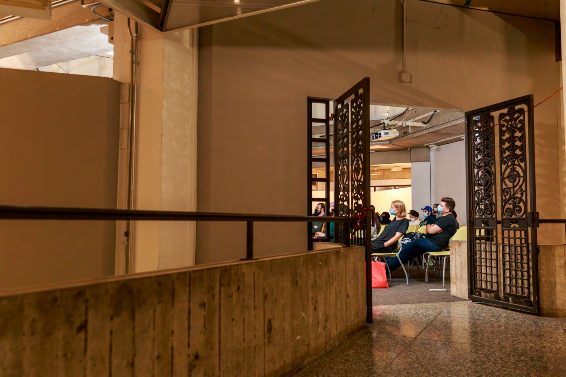
Gallery 1100 Lobby