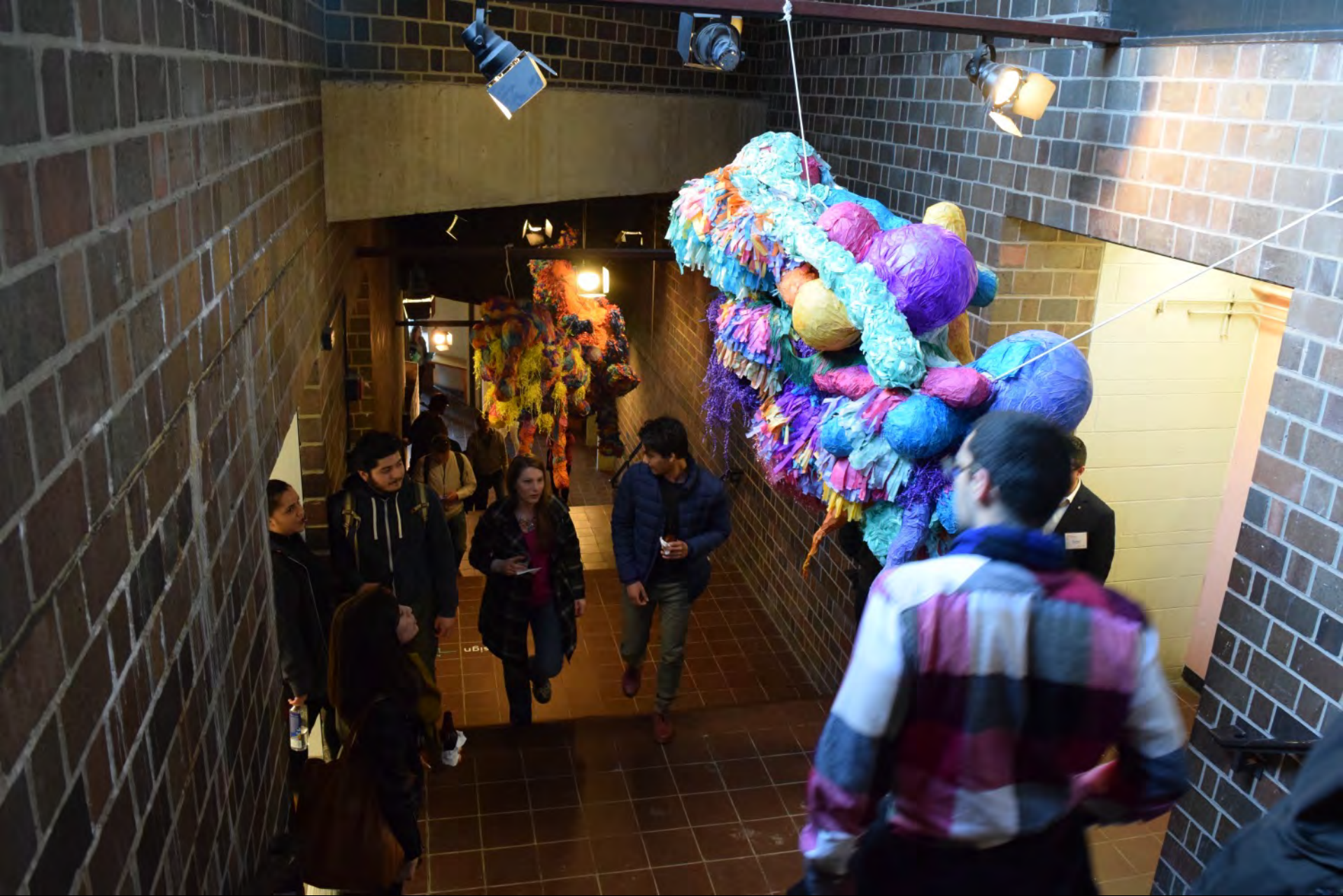
Stair between School of Architecture and School of Design