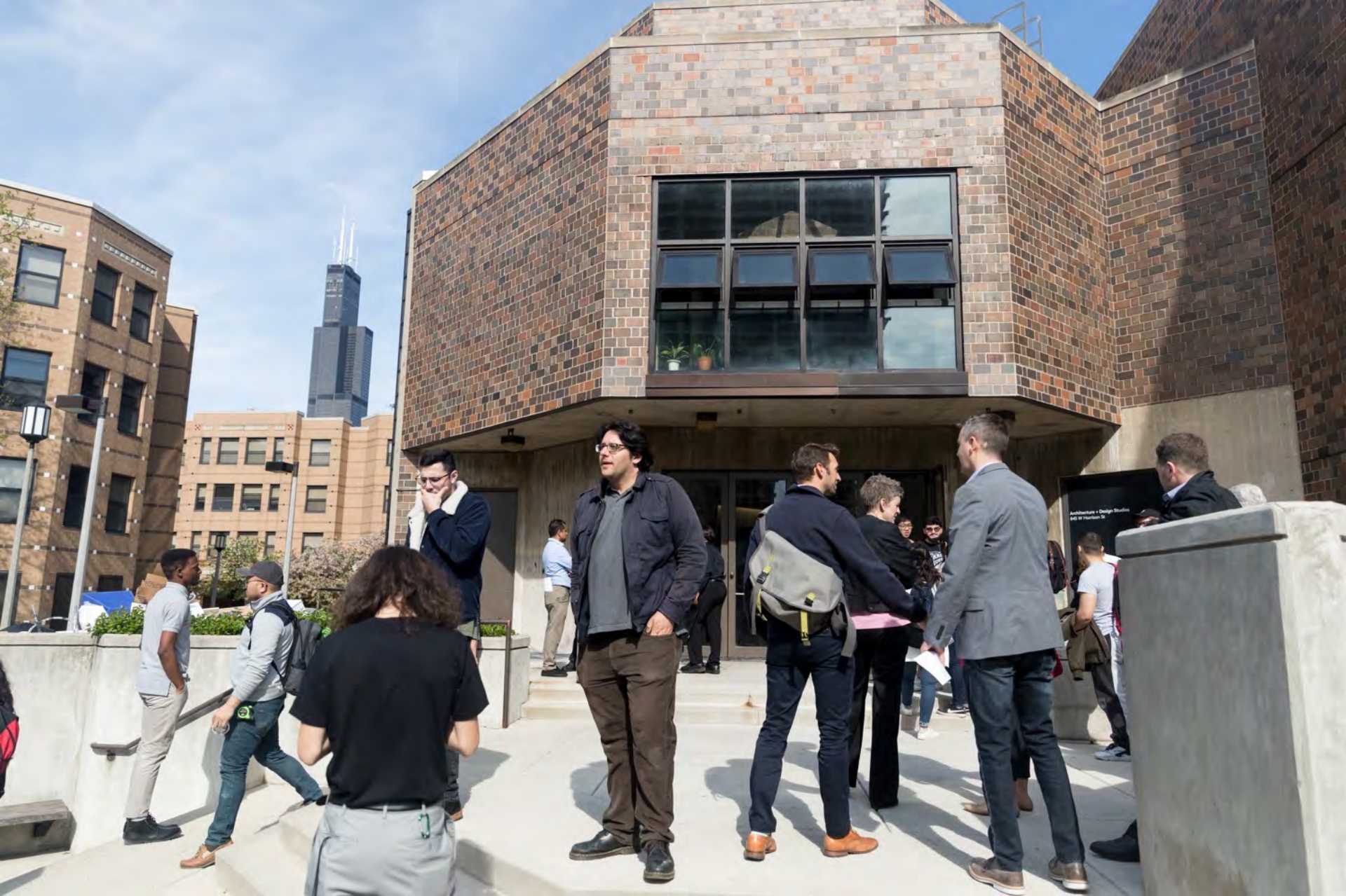
Architecture + Design Studios