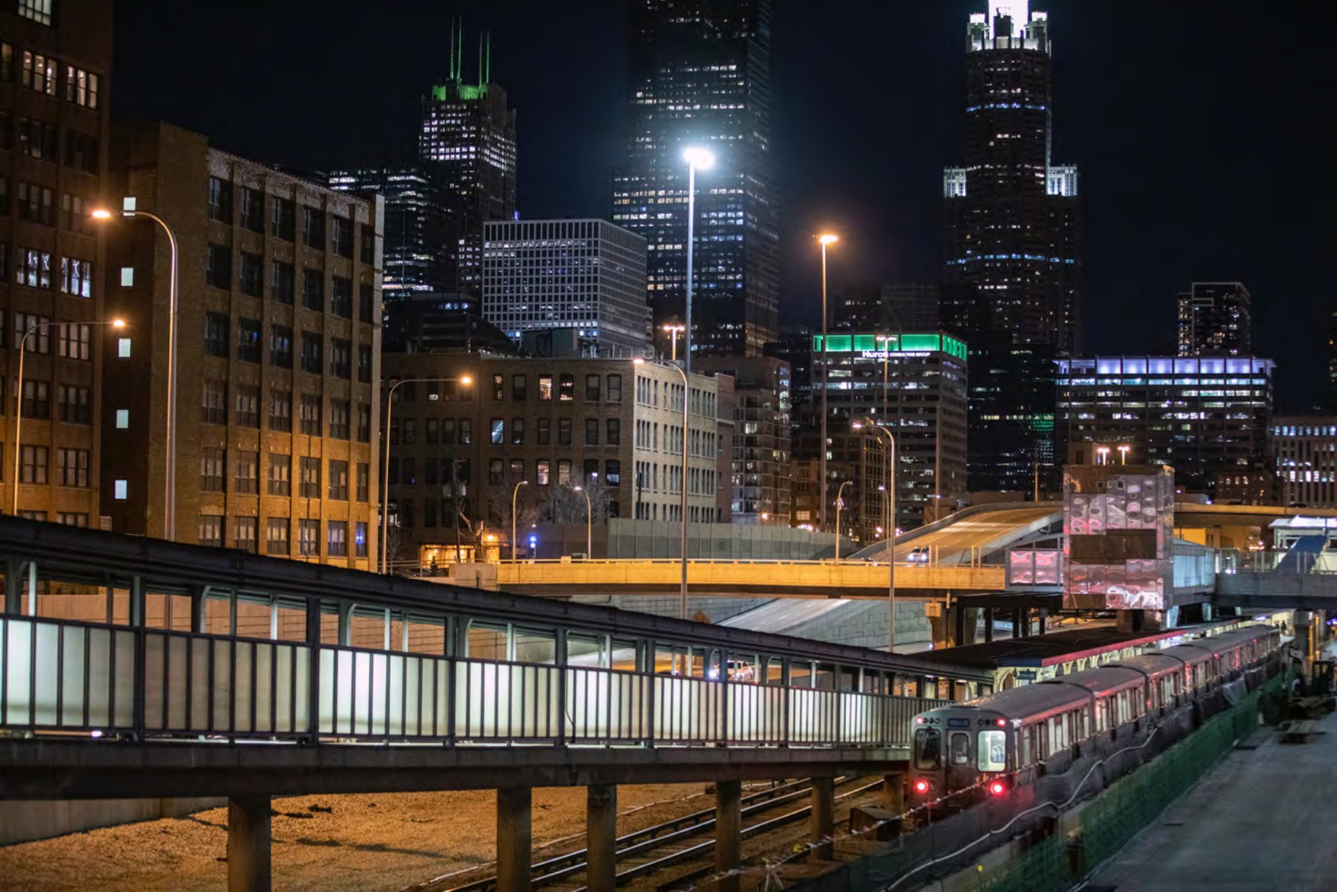
UIC CTA Blue Line stop