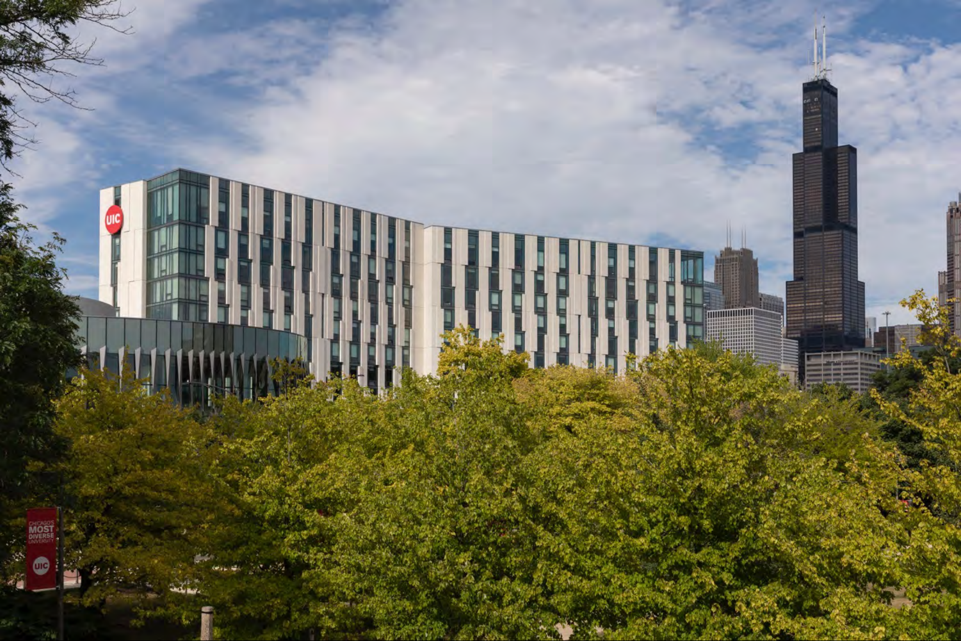
Academic and Residential Complex