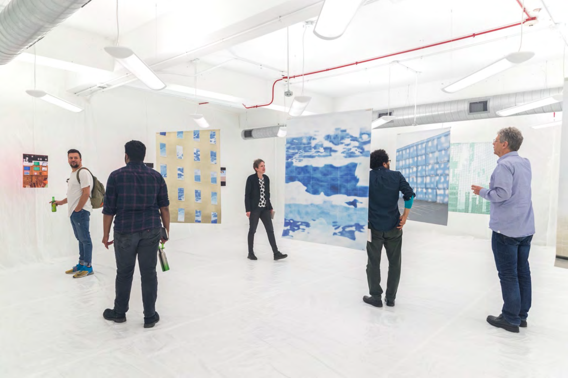
1300 gallery + classroom