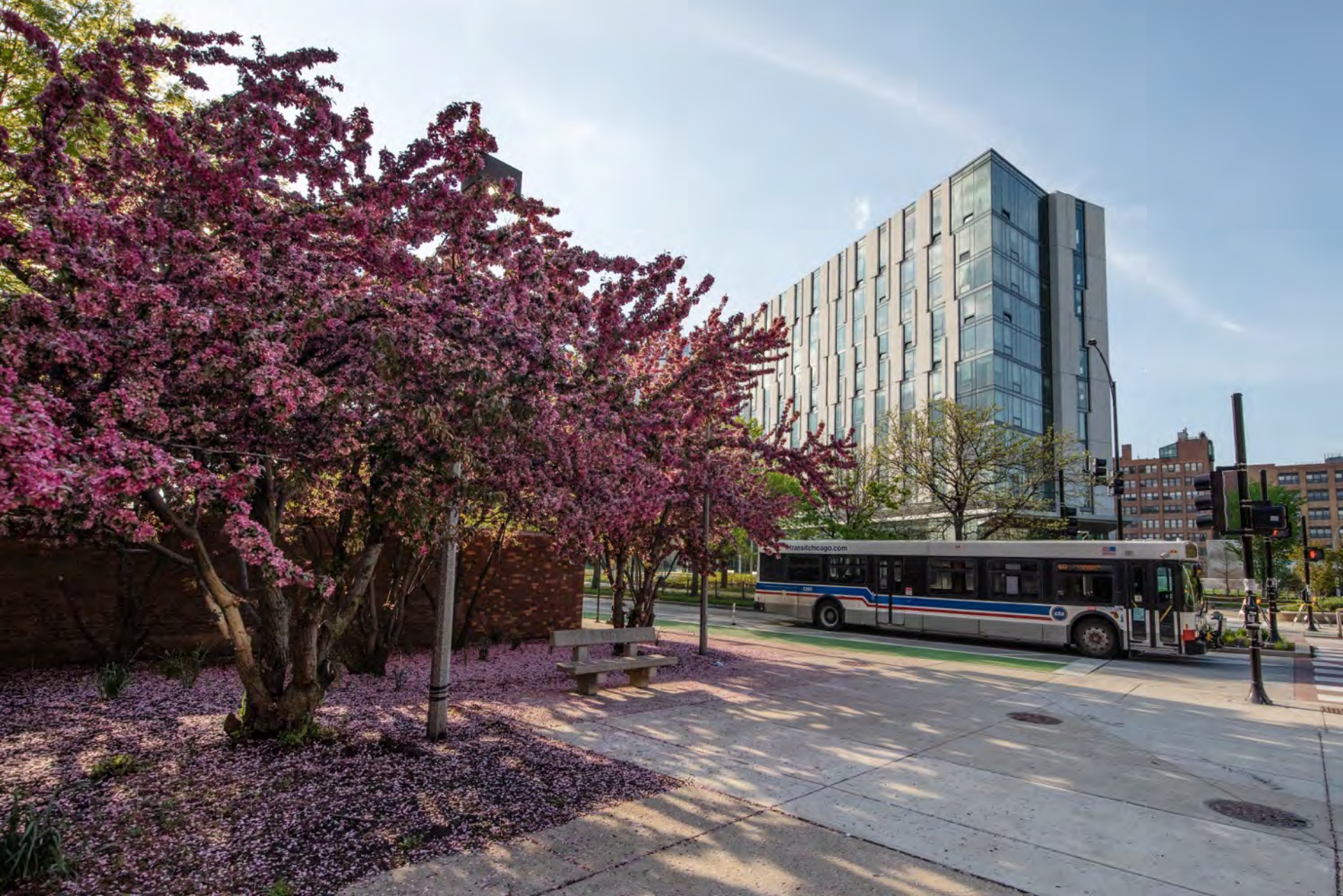
CTA bus route on Harrison Street