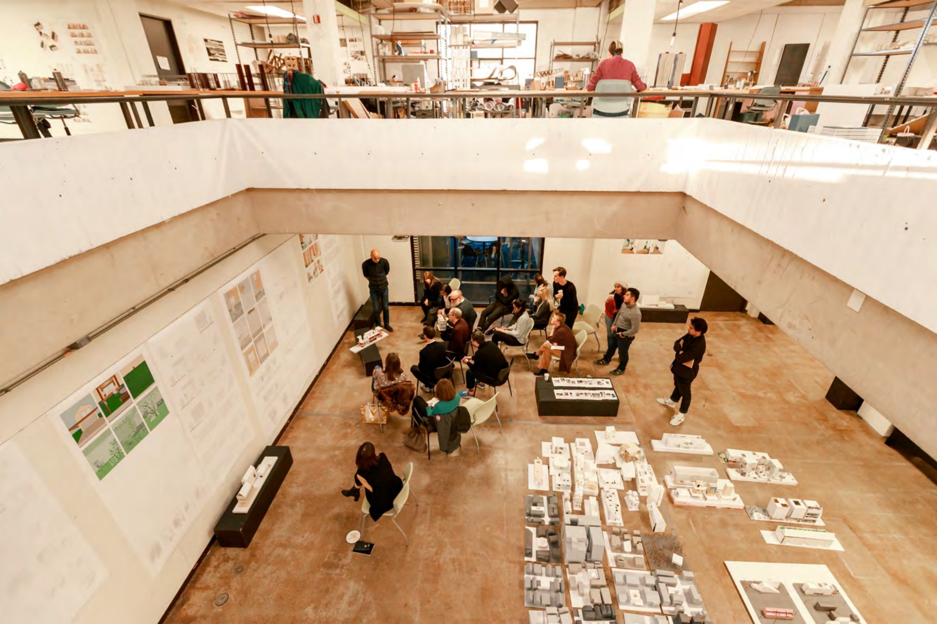
3100 Gallery (below) / Graduate Studio (above)