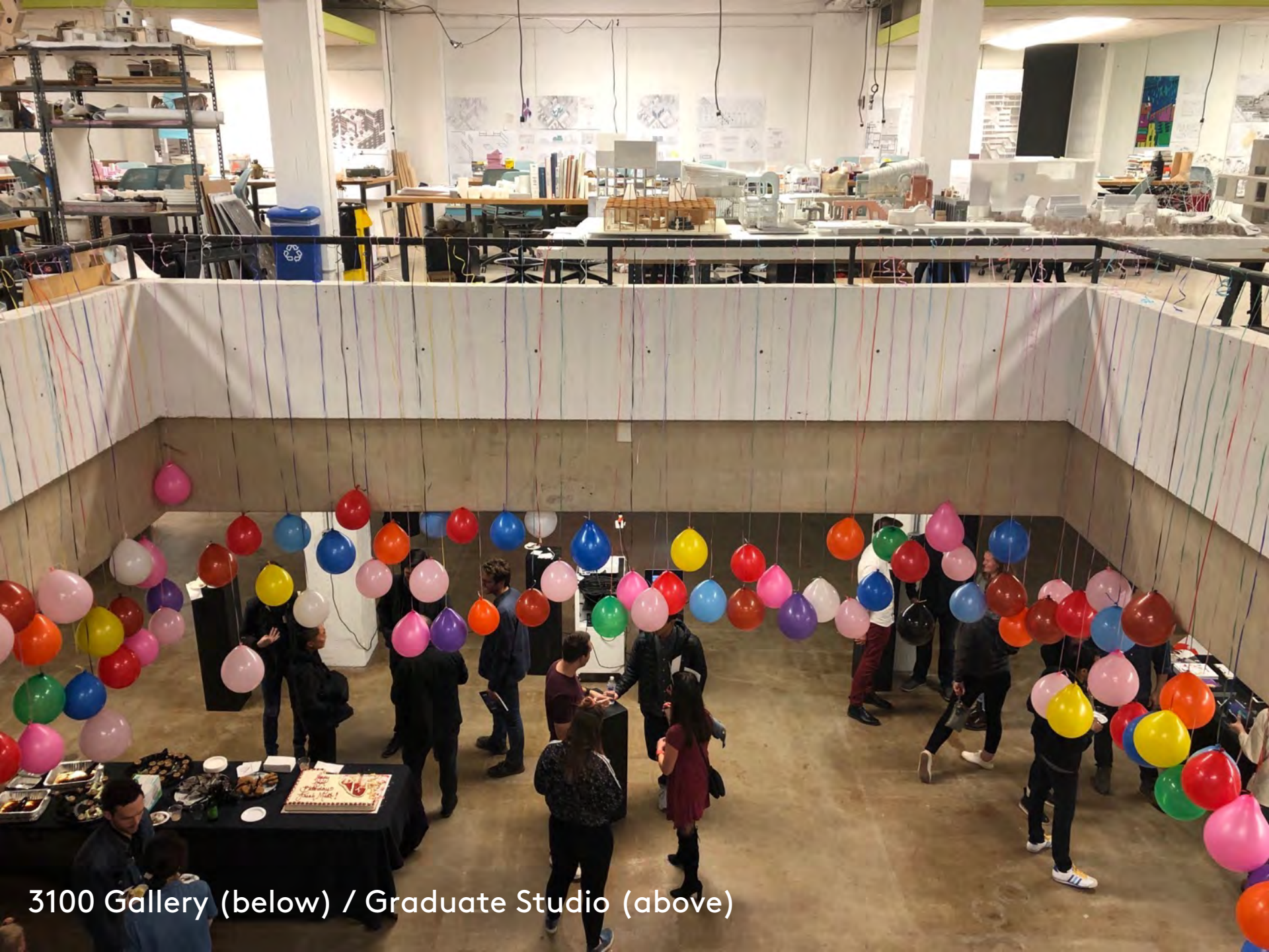
3100 Gallery (below) / Graduate Studio (above)